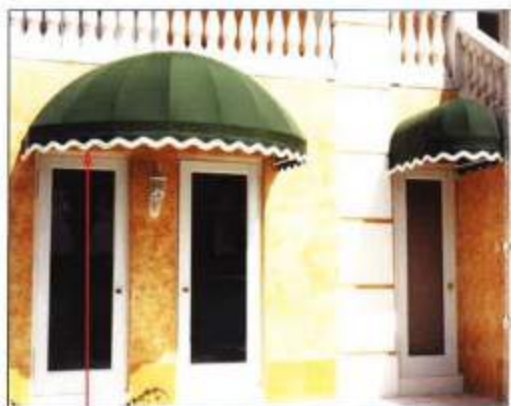
BULL NOSE w/BUILD OUT