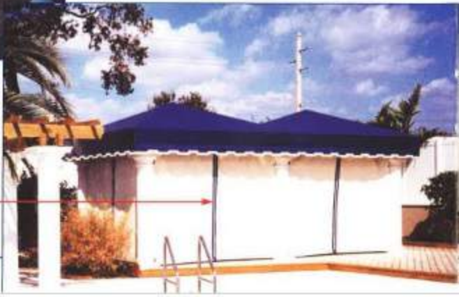
CURTAINS THAT RETRACT