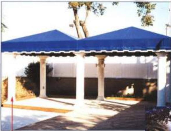
DECORATIVE CONCRETE COLUMNS