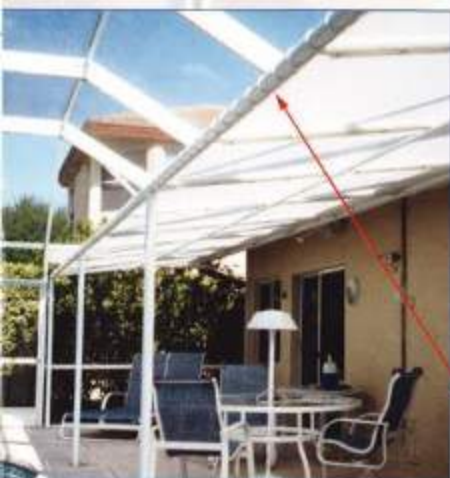
SINGLE FRONT BEAM