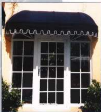
ROUND TOP w/QUARTER ROUND ENDS