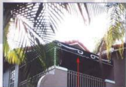
SILK SCREENED ACCENT BORDER