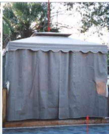
CABANA STYLE RETRACTABLE CURTAINS