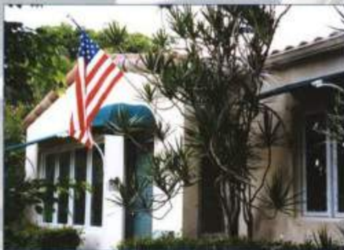
LEAN-TO W/SINGLE FRONT BARS